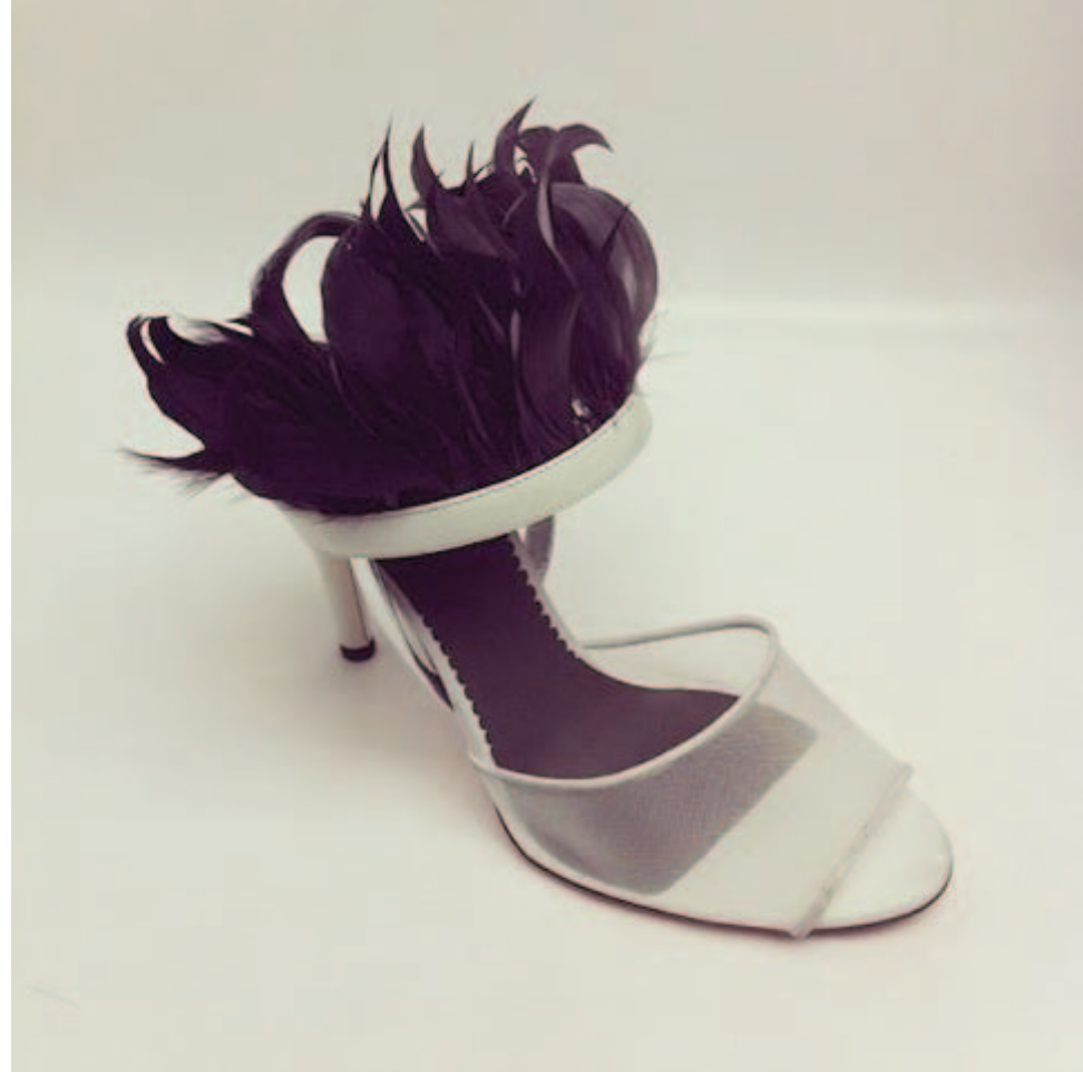
Fashion closet of Reed Krakoff.