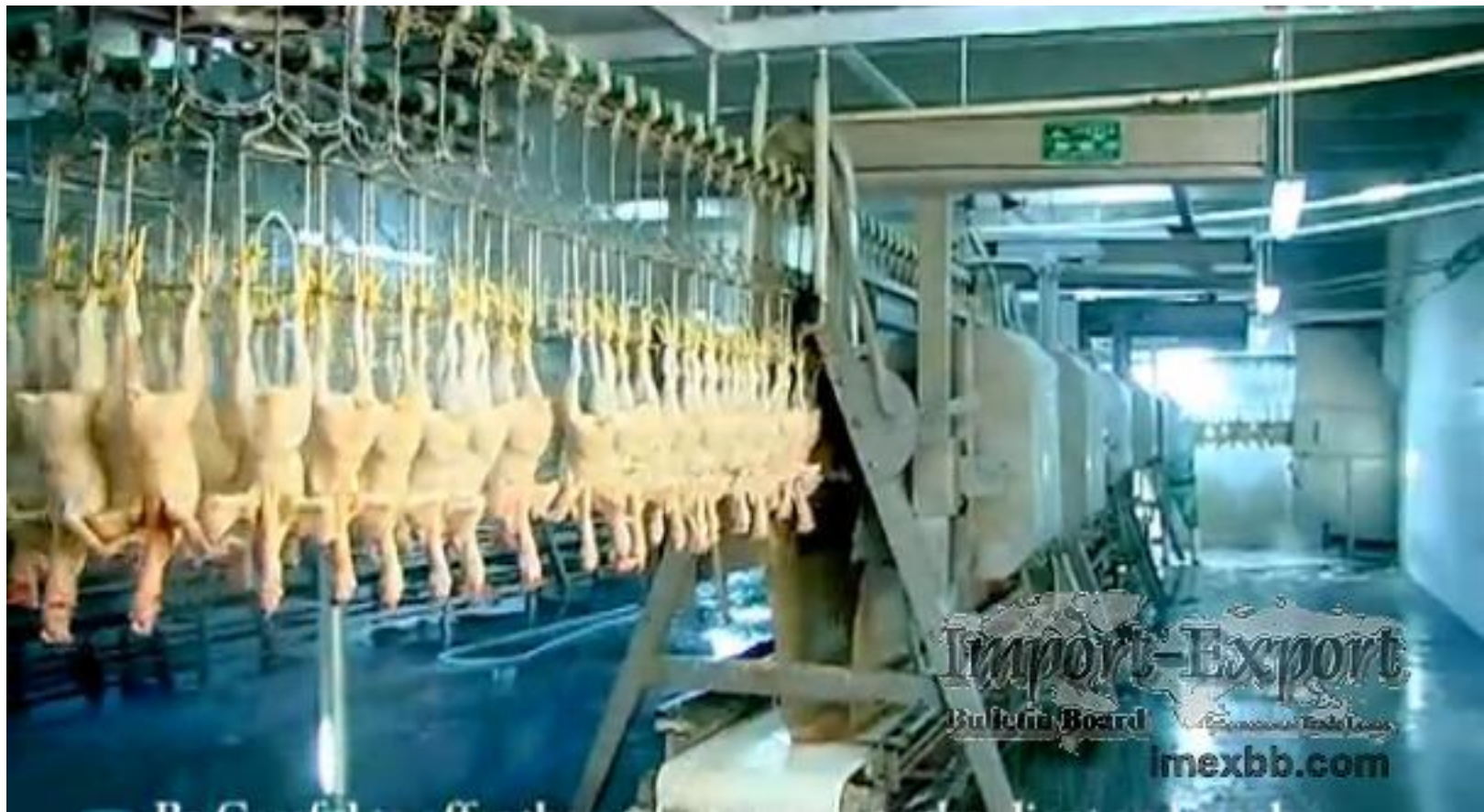
Ducks in a duck slaughterhouse.