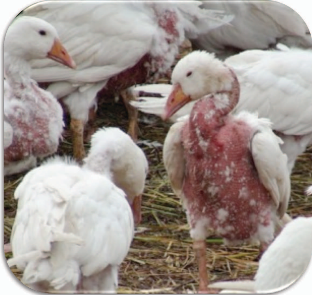
Photo of live-plucked geese on PETA Website.