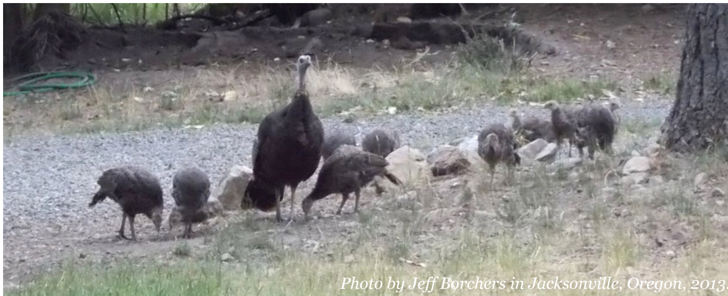
in Jacksonville, Oregon, 2013.