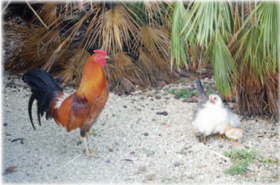
A chicken family in the Florida Everglades.

Hens hide their eggs to protect the embryos growing inside from predators – animals such as foxes, raccoons or hawks who would steal the eggs and eat them. In nature, the hen and rooster go together to look for and scoop out a ground nest that will camouflage the hen while she sits on her eggs for 21 days of incubation.