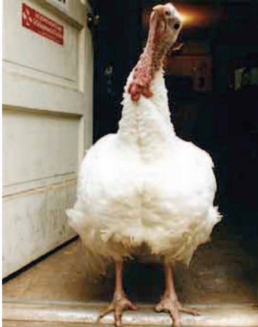
Photo of Abigail at UPC's sanctuary courtesy of The Washington Times .

Abigail invites us to get to know them . . .