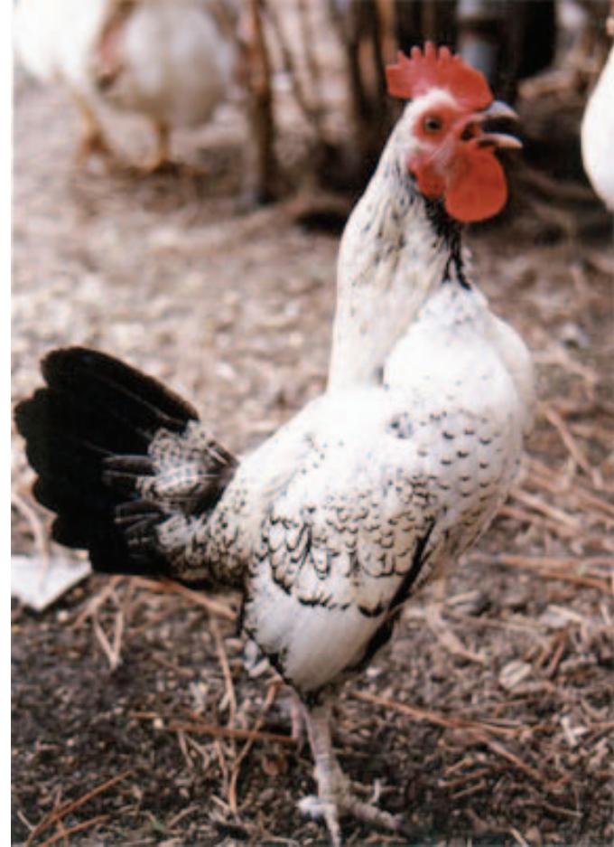
UPC rooster, Bantu, calls to his hens.

Scientists call these communications “locater crows.” As protectors of the flock, roosters are always on the lookout.