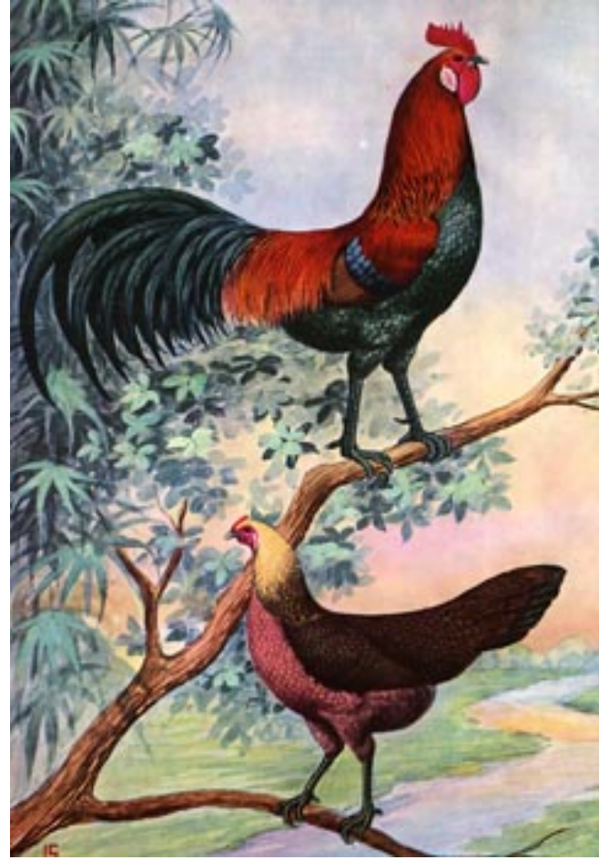
Art print of Red Jungle Fowl Chicken Rooster and Hen

Chickens evolved in the tropical forests of Southeast Asia and the rugged foothills of the Himalayan Mountains where chickens live and thrive to this day in a lush green world rich in sounds, colors, and vibrant activity.