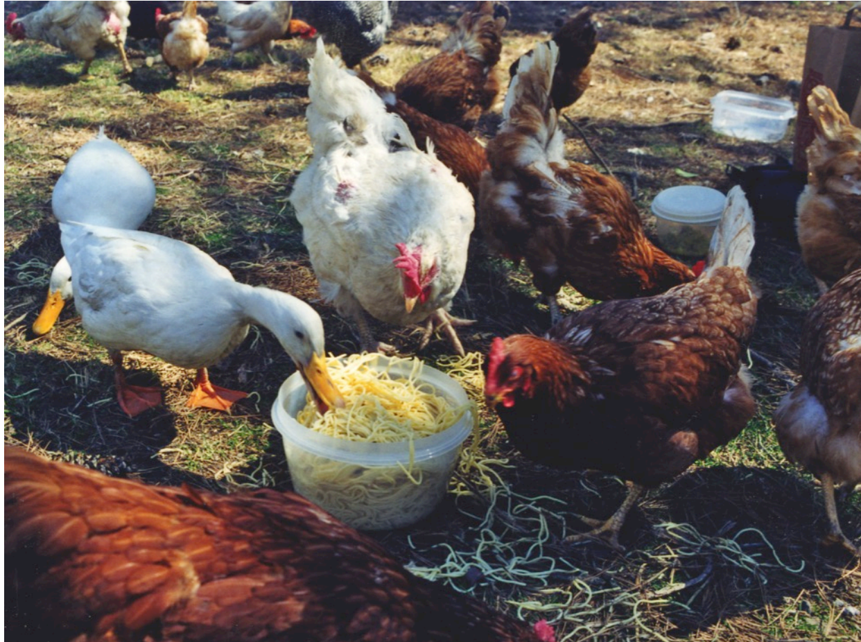
Our sanctuary chickens and ducks savor a spaghetti dinner in the yard.