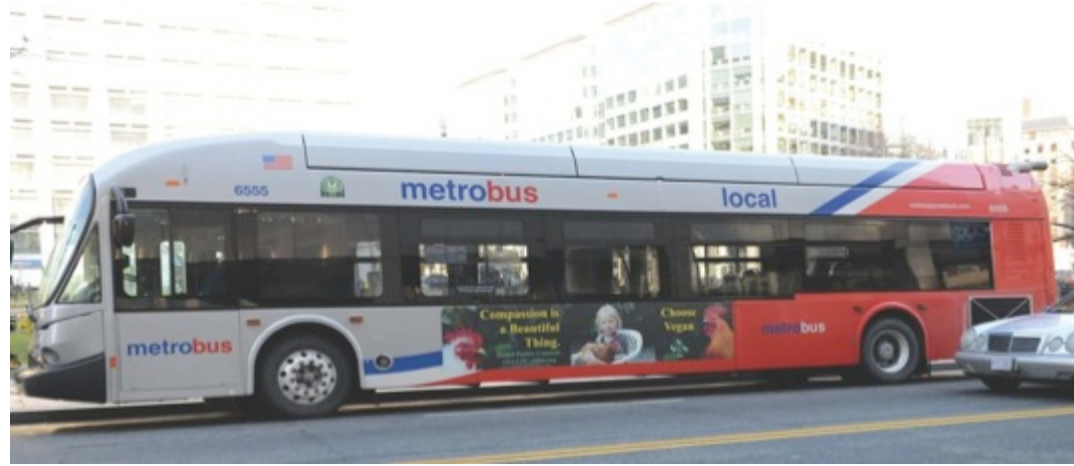
UPC Bus Posters in Washington, DC, 2013

We can choose to be kind to chickens and make them our friends instead of our food.