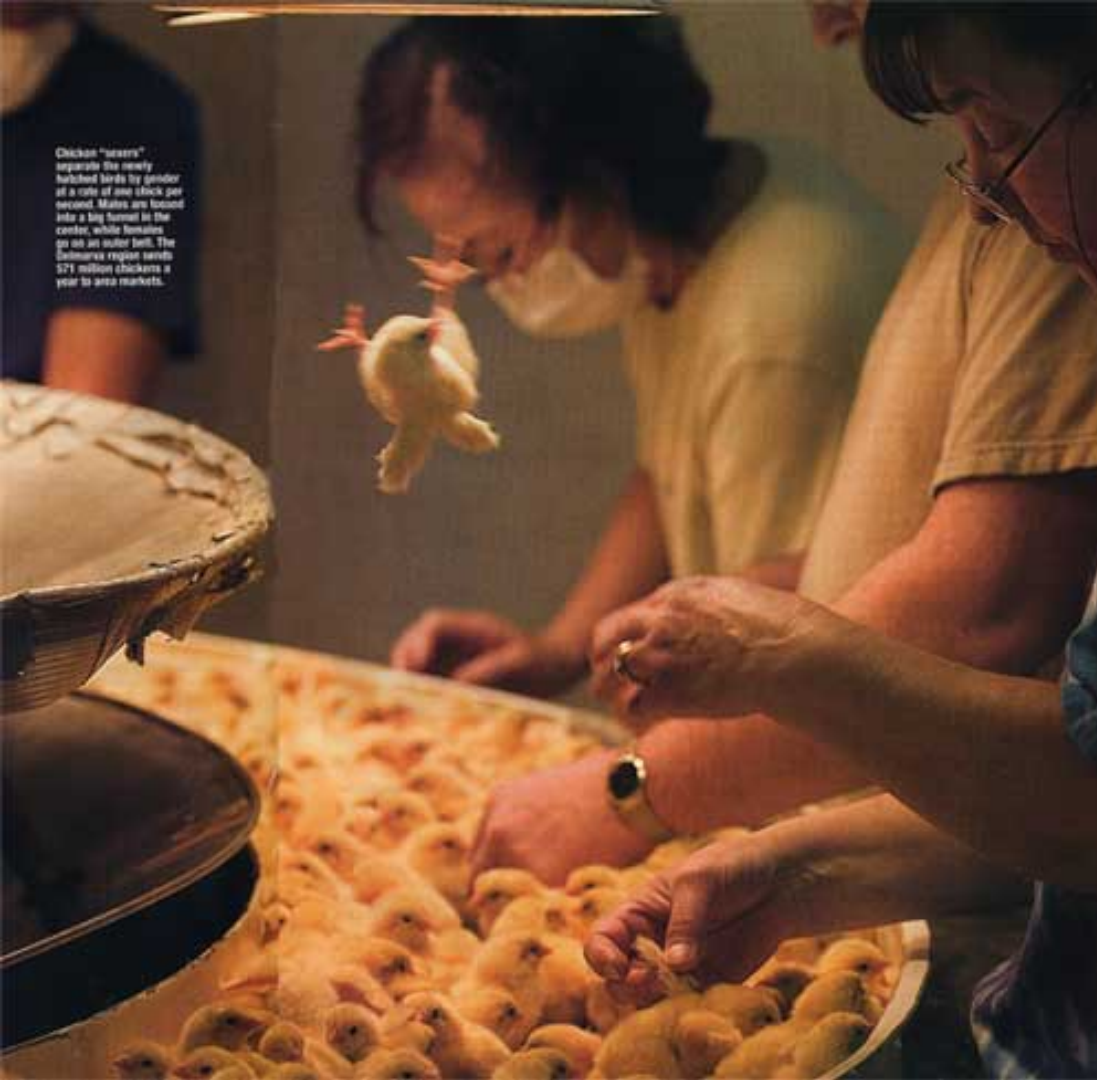
Chicken "sexers" separate the newly hatched birds by gender at a rate of one chick per second. Males are tossed into a big funnel in the center, while females go on an outer belt. The Delmarva region sends 571 million chickens a year to area markets.

Chicken “sexers” separate the newly hatched birds by gender at a rate of one chick per second. Males are tossed into a big funnel in the center, while females go on an outer belt. The Delmarva region of Maryland, Delaware and Virginia sends 571 million chickens a year to slaughter.